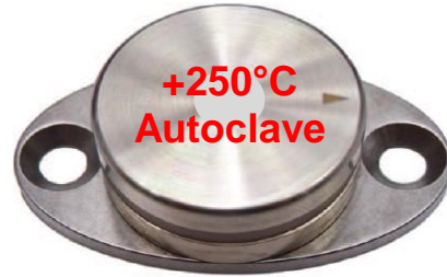
RF RW AC Tag