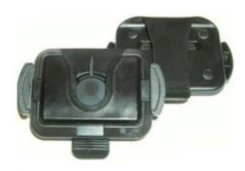
Standard with robust belt clip.