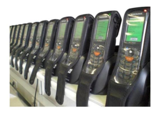
Charging and data transfer: The units remain in the protection bag.