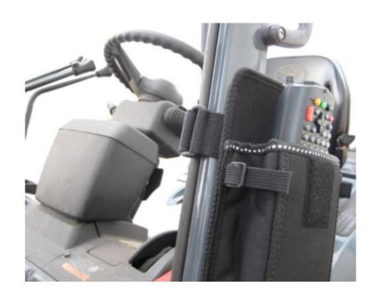
Accessories: Special belt as support for forklifts and other vehicles.