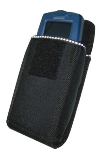
Open Version: in basic version without protection flap