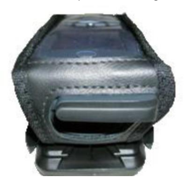
Suitable for GPRS-Versions.