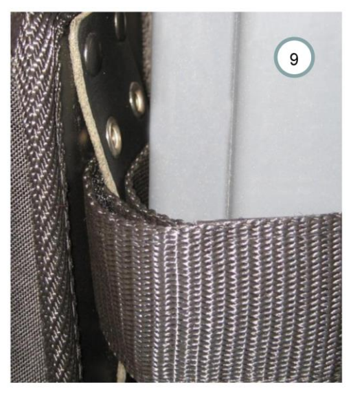
Accessories: Special belt as support for forklifts and other vehicles.

Additional accessories for individual applications on request