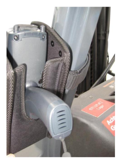
Accessories: Special belt as support for forklifts and other vehicles.

GunGrip-Holster Size I G (for Skorpio) M87509 GunGrip-Holster Size II G (Kymann, Falcon) M83562 Recommended Accessories: Hipp belt with fast mit quick release M45703